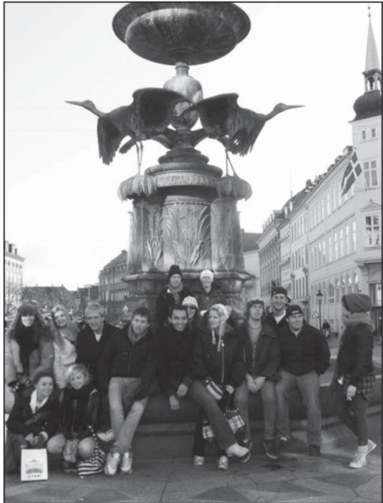
American and Swedish students pose in front of a Copenhagen fountain.

After only a week break, the Swedish students came to spend a week in Ann Arbor. They stayed in houses and apartments with University students and really got to experience student life at an American university. The Swedes shadowed