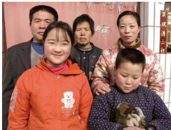
Care and Love , a 2007 documentary film by Ai Xiaoming

CCS Chinese Documentary Film Series: The Fall 2008 CCS film series will continue to present contemporary documentary films on modern culture and society in China. The film series will be shown on occasional Saturday evenings at 7:00pm in Auditorium A of Angell Hall on the central campus area of the University of Michigan. A complete schedule is available from the Center for Chinese Studies at 734-764-6408 or from the center's website at: www.ii.umich.edu/ccs . The series will begin on Saturday, Oct. 4 with a showing of Care and Love , filmmaker Ai Xiaoming's portrait of the devastating personal toll of AIDS in the Chinese countryside. On Oct. 11 we will show China Blue , a powerful and poignant journey into the harsh world of sweatshop workers. Other presentations include: Oct. 25, Red Capitalism: China's Economic Revolution ; Nov. 1, No Sex, No Violence, No News: The Battle to Control China's Airwaves ; Nov. 8, Last House Standing ; Nov. 15, Shanghai Bride , and on Nov. 22, we will show director Wu Wenguang's documentary on provincial farm workers in Beijing who agree to participate in a dance performance called Dance with Farm Workers . All film presentations are free and open to the public.