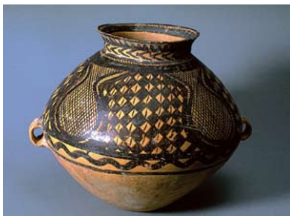
Large Storage Jar , China, Majiayao Culture (2600BCE–2300BCE), earthenware with mineral pigments, Gift of Domino's Pizza, Inc., 1993/1.46