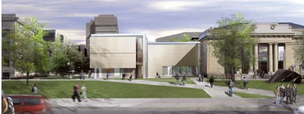
University of Michigan Museum of Art, View from State Street

The new UMMA will also boast an auditorium, classrooms, and community meeting rooms that can be used for teaching and additional programming. We strongly hope that this dynamic new environment for learning and discovery will foster the exciting intellectual partnerships developed with all of the Asian area centers, including the Center for Chinese Studies, as it reflects UMMA's longstanding commitment to Asian art.