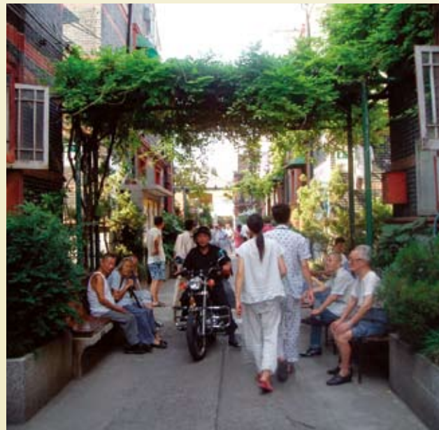
A still vibrant street in historical Shanghai.