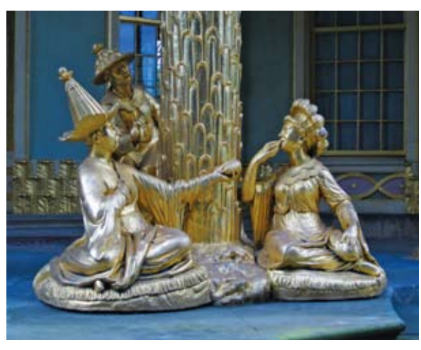
Top Photo: Painshill, an 18th century English garden with it's Chinese-inspired garden rock. Lower: Frederick II's Chinese teahouse at Sans Souci outside of Berlin with its Chinoiserie fantasies of a Chinese tea party.