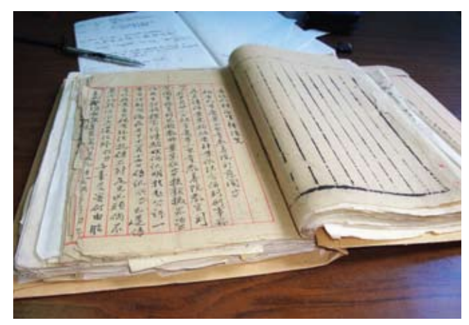
Top: Master Fazun's funerary monument on Mt. Wutai (Martino Dibeltulo) Lower: Manuscript, Sino-Tibetan Institute, Chongging (Martino Dibeltulo)