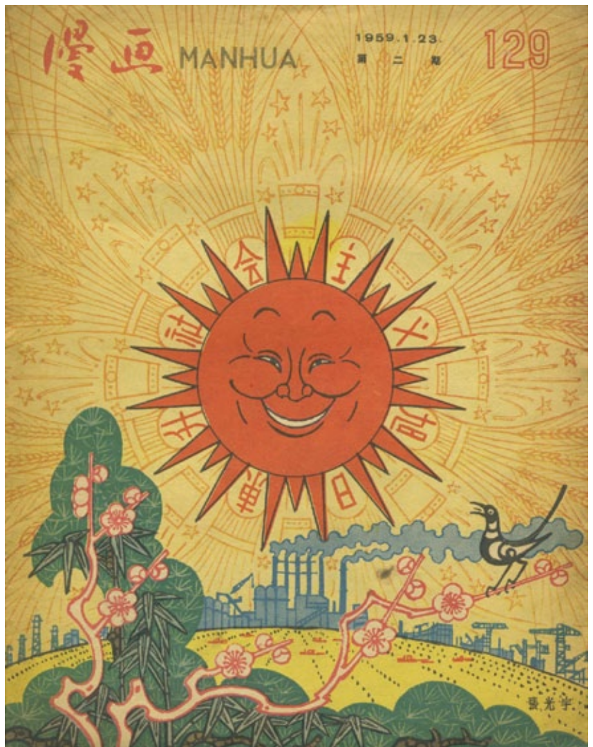
Graphics from CCS Annual Conference: Socialist Culture in China Reconsidered , Oct. 25-26, 2013