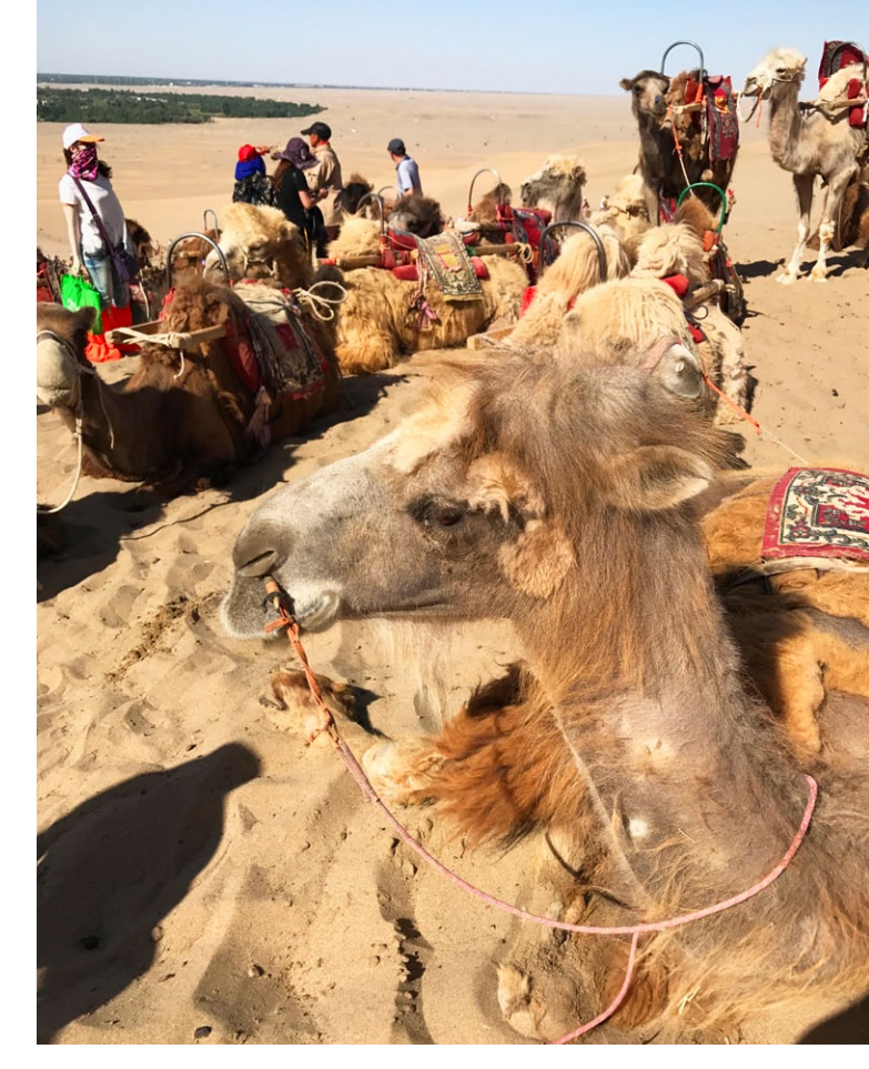
Dunhuang, China.

April 6-7 Conference. "Africa-China: Infrastructure, Resource Extraction, and Environmental Sustainability." Co-sponsored by African Studies Center; LSA; Afroamerican and African Studies; School of Natural Resources; Confucius Institute; ALC; Institute for the Humanities; Office of Research; Institute for Sustainable Business.