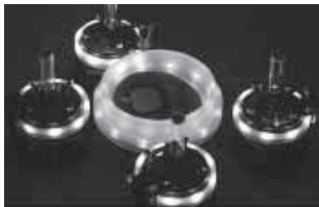
ECSS 2010: experimental evolution