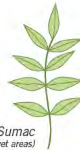
Poison Sumac (Grows in wet areas)

Alcohol, campfires and outdoor cooking are not permitted.